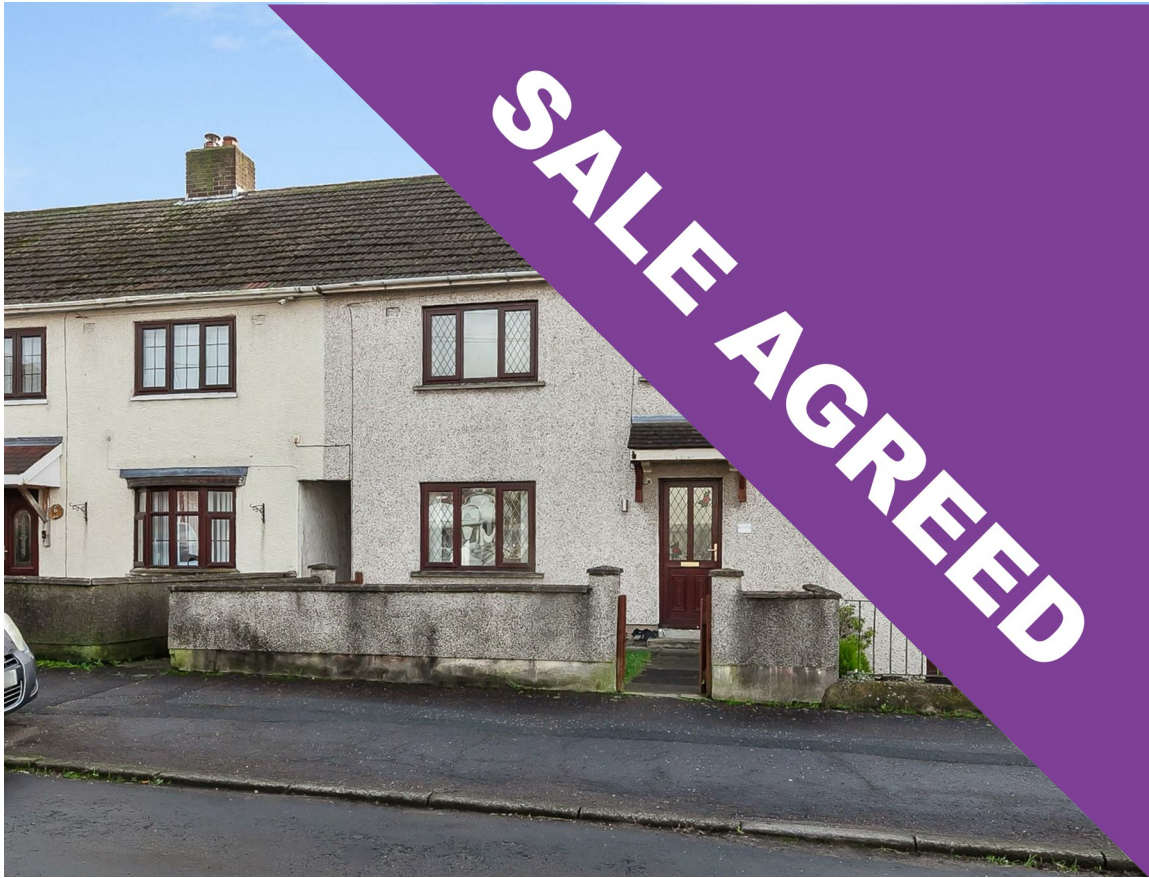
19 Thorndale Square, Carrickfergus, BT38 8JX